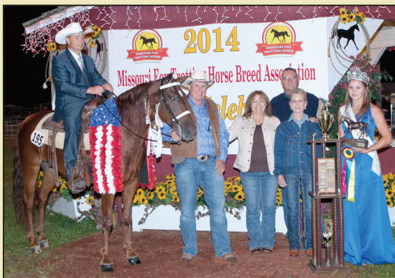
Above photo: 2014 World Grand Champion, Legend's Wendy.

The Missouri Fox Trotter—versatile, stylish, intelligent, gentle and smooth. It is truly a horse for all ages and all disciplines.