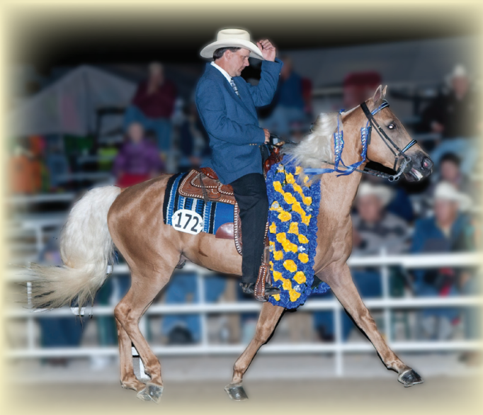
The famous Fox Trot silhouette illustrates the diagonal nature of the gait.

The canter is a broken, three-beat gait, and should be performed with collection. In the canter, the feet strike the ground in this sequence: (1) the outside rear foot, (2) the inside rear and outside front, simultaneously, and (3) the inside front. This produces the three-beat cadence. The Missouri Fox Trotting Horse can perform an athletic lope or a collected rocking chair canter.