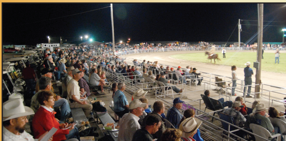
The thrilling World Grand Champion competition during the World Show and Celebration at Ava is the pinnacle event of an exciting week.

The Missouri Fox Trotting Horse Stallion Tour, held in odd-numbered years, is a fun-filled day-long event where attendees are chauffeured in a luxury motor coach to meet some of the breed's top stallions. The tour takes place in Missouri, but stallions from outside the area are featured on video monitors in the coach, so attendees can view them en route. The Tour is an excellent way for potential breeders to meet a line-up of stallions, and is valuable to stallion owners who benefit from more than two years of advertising leading up to the tour.