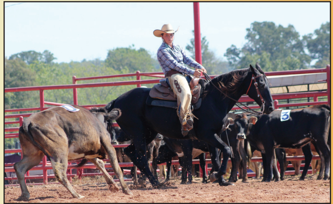
Ranch Horse classes are popular with Missouri Fox Trotting Horse owners.

Versatility: Many exciting classes take place in the versatility arena. These include western pleasure, horsemanship, English, reining, barrel racing, pole bending, and ranch horse competitions. These classes follow the same guidelines as other breed competition for these events with one exception: In most classes, horses are expected to perform a fox trot.