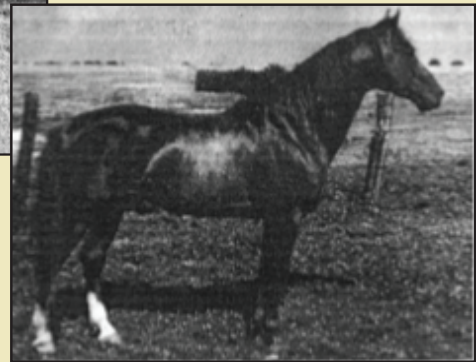
Upper photo: Nancy Ann F-166, dam of Lady Ann & Golden Rawhide. Lower photo: Cotham Dare F-19 sire of many early Missouri Fox Trotters.

In 2002, the Missouri Fox Trotting Horse was honored by being named the official state horse of Missouri.