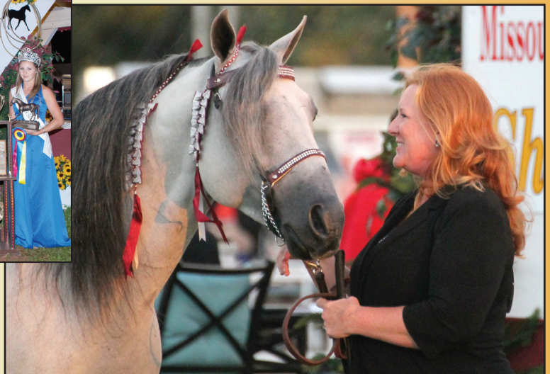
Photo to the right: Model classes showcase the beauty of the breed.